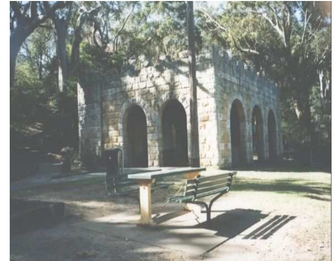
Constructed during the Great Depression 1929 - 1932